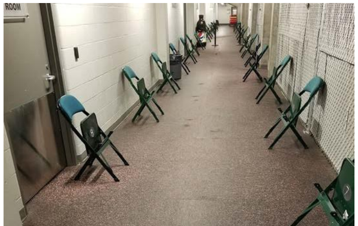
The seating area for Kin 1 is located in the hallway beside the ice surface. Seats are spaced two metres apart.